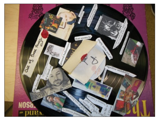
Fig. 4: Researcher reflexivity collage

In addition, the students had the option to create their collages on-line, such as on a personal website or blog (see Figure 5). Since this was done during class time, students were able to share the processes behind their reflexive collages. Reflexivity is not done alone; instead it is a way to engage the classroom together in a powerful way (Warren, 2011).