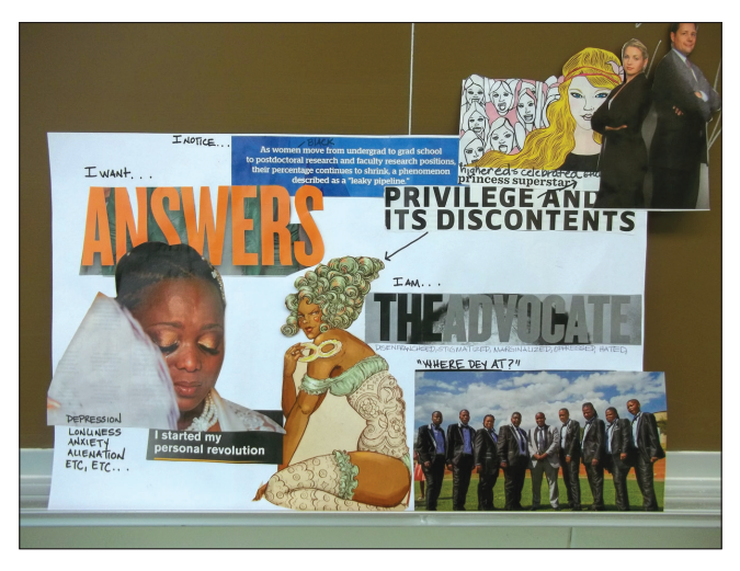
Fig. 3: Researcher reflexivity collage