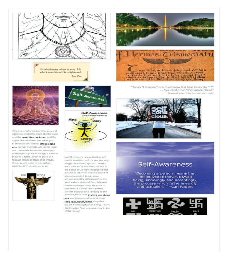
Fig. 5: Reflexivity blog