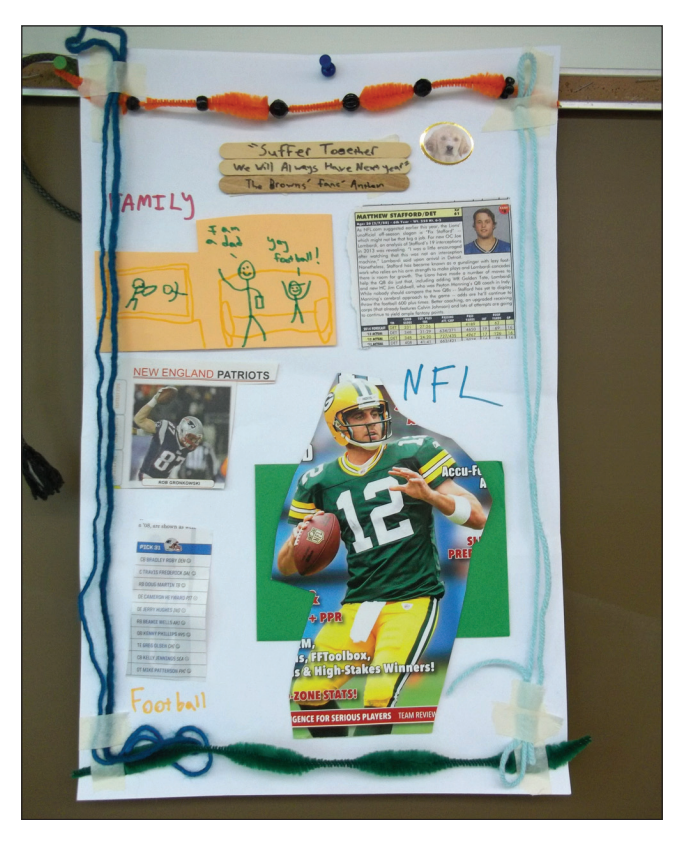
Fig. 2: Reflexivity interview collage

In the class period following the reflexivity model exercise, students created their own reflexivity collages. The instructor asked them to bring their reflexivity journals and consider the reflexivity models they had created to present an interview or interviews from their class homework as a collage poem (see Figure 2).