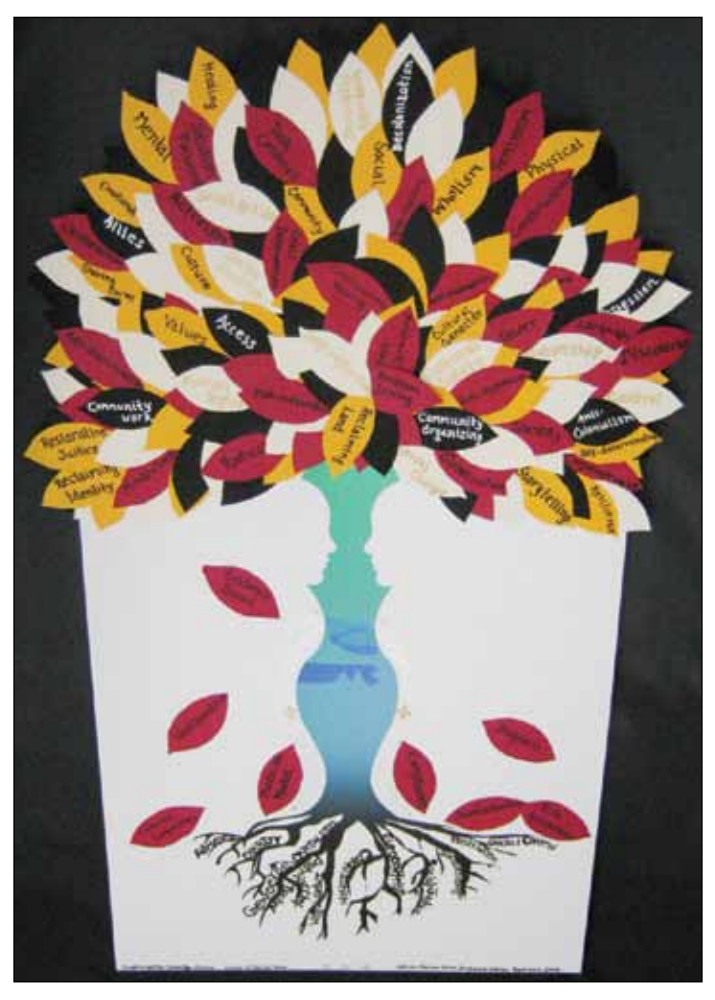
Fig. 1: "Social work tree"

a bottom-up, grassroots approach, we can effectively guide the reader through a visual representation of social work beginning at its roots, and continuing through the trunk and up to the leaves. The "social work tree" is discussed below in three main sections: roots, trunk, and leaves (see Figure 1).