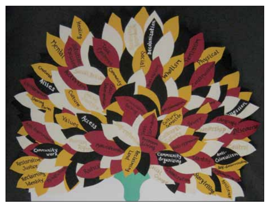
Fig. 4: "Social work tree - leaves"

Our project follows a similar philosophical aspiration as the Wheel—that all aspects of social work, regardless of differences, are interrelated. As Thomas and Green (2007) argue, the Wheel "has no beginning and no end and teaches us that all things are interrelated" (p. 2). The Wheel suggests a continuum, unlike the linear thinking of mainstream social work which often proceeds in separate and disconnected ways.