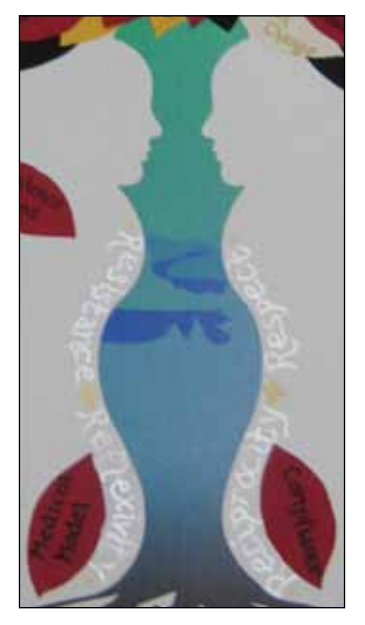
Fig. 3: "Social work tree – trunk"

The concepts of respect, reciprocity, reflexivity, and resistance were selected to frame the trunk of our "social work tree" because of their importance in helping to bridge the gap between mainstream and Aboriginal social work (Fook, 2002; Green & Baldry, 2008). The applicability of these concepts to both Euro-Western and Aboriginal perspectives makes these central pillars to hold up the trunk of our tree. Like Briskman (2007), we believe that critical and progressive social work has some relevance to Aboriginal social work, particularly in challenging Eurocentric knowledge systems in the academy (See Figure 3). The four concepts of critical and Aboriginal social work that frame the trunk of our "social work tree" are discussed as follows.