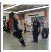
> HIP-HOP 2

In addition to my own suggestions, the feedback that is sought and given by their peers helps to fine-tune the choreography so that it evolves into a more powerful and significant form of expression and message making. The classroom becomes a level playing field as students take risks and learn to solve problems both individually and as a group. Despite academic or physical challenges, students are accepted with warmth, mutual respect, and consideration contributing profoundly to the building of self-esteem within and, ultimately, outside of, the classroom.