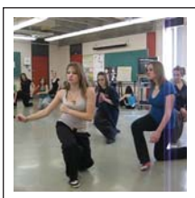
> HIP-HOP 1