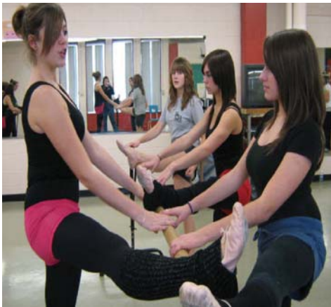
Fig. 2: Bar work: strength and concentration