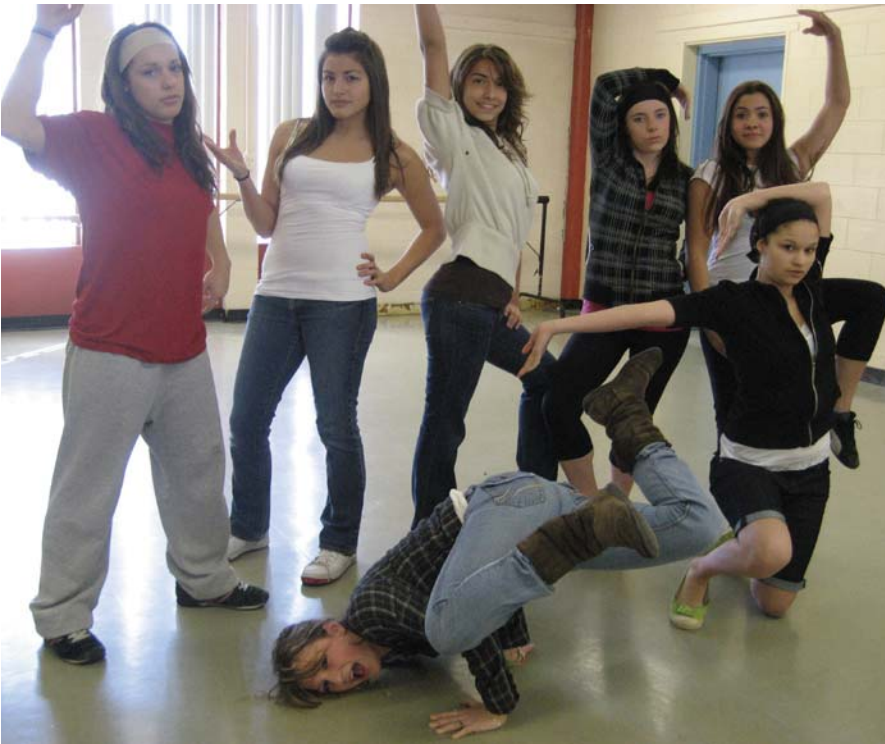
Fig. 5: Experienced Secondary 5 dance students modeling openness in learning each others' genres