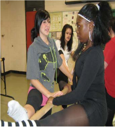
Fig. 4: Nurturing self-discipline