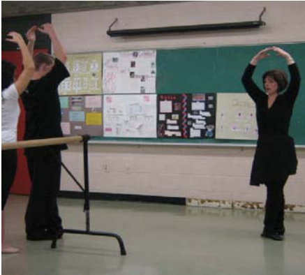
Fig. 1: Developing posture, grace and poise