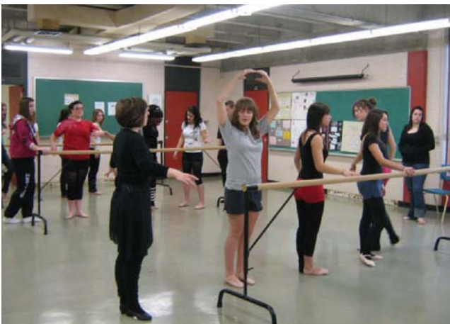
Fig. 3: Classical ballet: diverse ability and skills