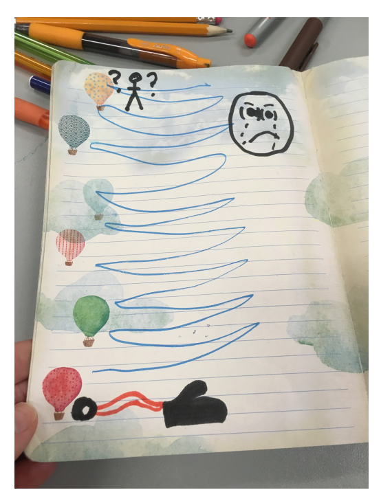
Fig. 3: Devon's "Missing Mitten" journal entry

I found the transition between the first and second journal entries of each child interesting; it varied among students over the weeks depending on what was going on in each student's life. As a class, we spoke about being in the present moment as mindfulness.