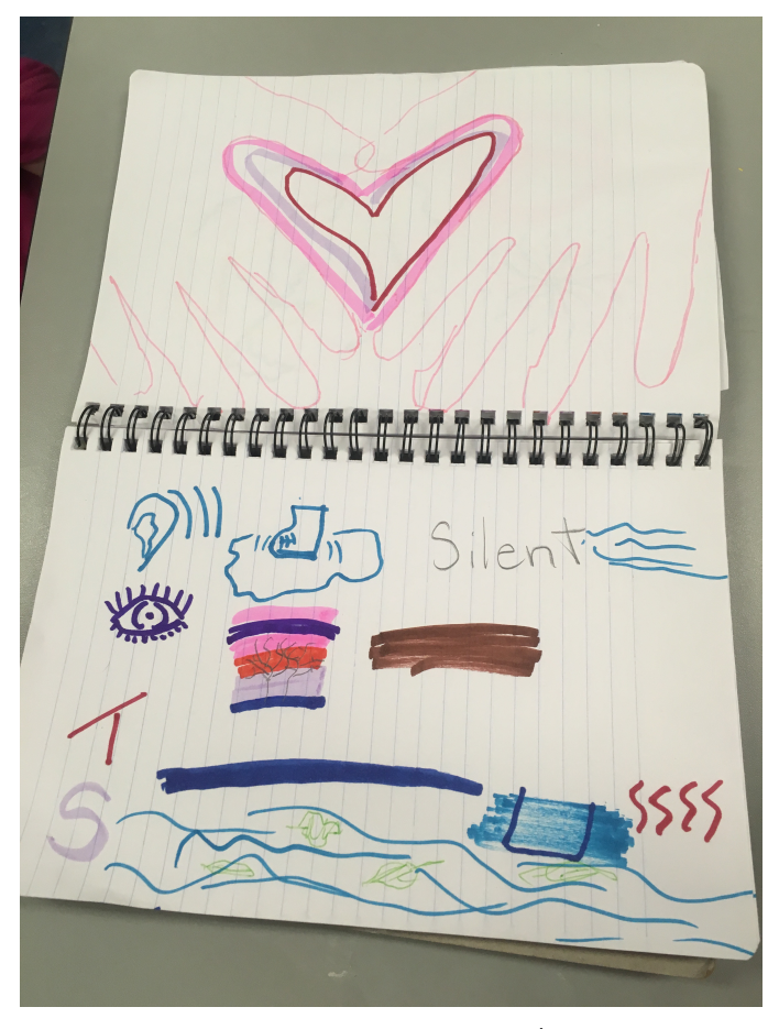
Fig. 4: Casey's "Five Senses" journal entry

Following our nature walk, the students depicted their experiences in their journals, which they then shared in circle discussions. Casey described a drawing that focused on her five senses: "Touch—I couldn't feel anything because of my mittens, but I could feel that I had warm hands. The sound was quiet-I drew squiggly lines. Taste-it was nothing. Smell-I smelled fresh air outside, but now I smell chlorine inside. See—I could see the sunset—it represents nature and my heart" (see Figure 4). Moving through all five senses is a good example of what mindfulness is about, experiencing the world in different ways, in the present moment, as it exists and as you exist. Casey, using the description of "warm hands" and drawing the calm squiggly lines to show quiet and peace in light blue hues, showed me where she was in that moment; Casey was present, in the field, feeling and reflecting on being in nature. Again, it was more than her words I was interpreting, but also the colours, her calm smile, and the deep inhale as Casey said, "I smelled fresh air outside." I must admit that the contrast between the fresh air and the smell of chlorine in the Sports Complex was surprising to me. Although I had noticed the smell of chlorine myself, I did not think that the smell would enter into their journals. Casey showed me that through all her senses, she was comparing the peaceful sensations of being outside (in the cold, no less) with the warm, chemical-filled air inside.