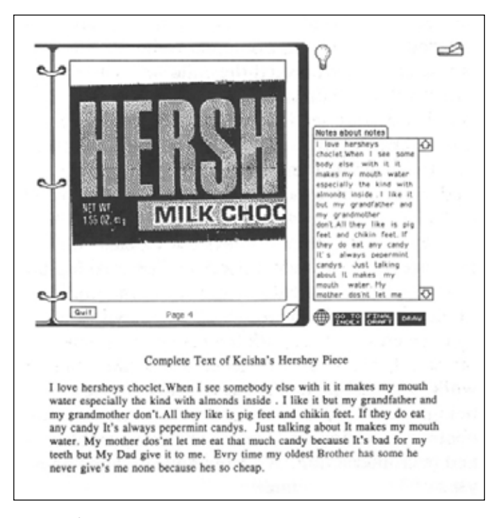
Fig. 2: Keisha's story

write individual entries for a neighborhood culture book, drawing on multi-media resources as they wished. In addition to the image and sound database, which all students had access to, resources included digital drawing tools, word processing, and basic formatting for arranging words, images, and a sound icon digital printable pages, like the one below.