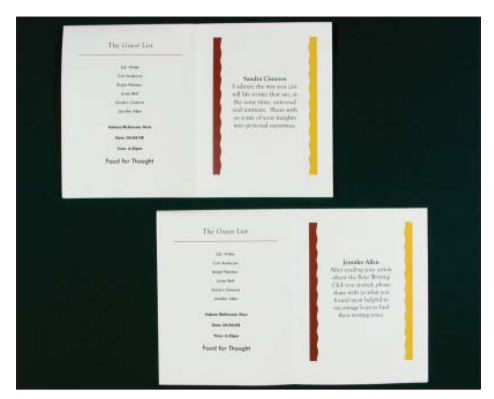
Fig. 3: The guest list