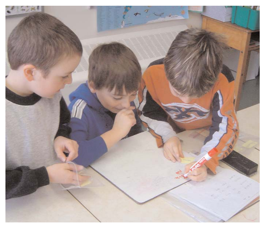
Fig. 6: Active, enjoyable involvement in checking spelling

Cathy taught her class reading strategies such as predicting, using illustrations, skipping the word and reading ahead, and finding smaller words within bigger words. Her students also learned other reading strategies such as retelling stories, sequencing illustrations, and answering comprehension questions. All of these reading skills were taught within the context of the peer tutoring program and the children valued their importance since they realized that they would be teaching these strategies to their buddies. Consequently, they were positively energized to acquire reading skills and delighted in assuming personal responsibility for tutoring their partner (Reeve et al., 2004).