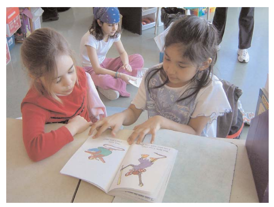
Fig. 7: Personal interest in reading

children to make their own choice of books in order to maintain their autonomy in the reading process and also to foster a love of reading. They taught their students how to choose books at their independent reading level and it was inspiring to see the concentration and interest of the children as they pored over books in the class library.