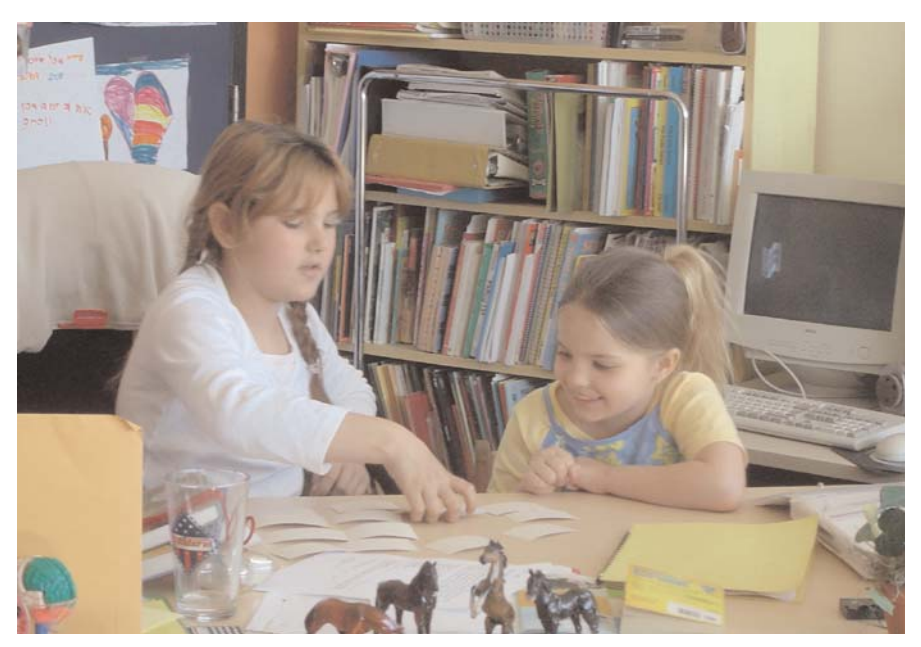
Fig. 8: Pleasure in learning