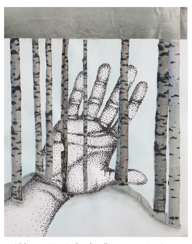
Fig. 4: Can I see my hand for the trees? February 2018, mixed media collage on paper, 8 x 9 in.

That's what makes guides so tricky—you never know if you can trust them and if you do extend that trust, how far are you willing to commit? Sometimes guides impair clarity and obscure the very thing you are trying to see. Other times, they offer a sense of direction, a pathway toward endurance. Choosing to blend methods of guidance can achieve enhanced visibility and even facilitate affirmation and trust in the process—your process.