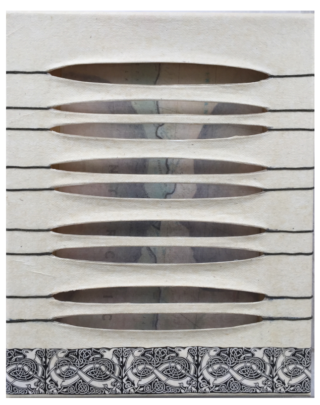
Fig. 1: What if I look inside? April 2018, mixed media on canvas, 8 x 10 in.

My portrait reveals and conceals an identity at times struggling to find a place of acceptance and understanding for an unconventional reflexive praxis. The two facial profile images represent aspects of one identity—one working within acceptable limits and expected practices, and the other engaging in an alternative, less predictable manner. Set beneath the canvas surface, the two identities peel away at ideas, uncovering concepts related to intentional discovery. Looking inside is how I might learn to know, opening a door to potential believability and play as a site for intertextual becoming.