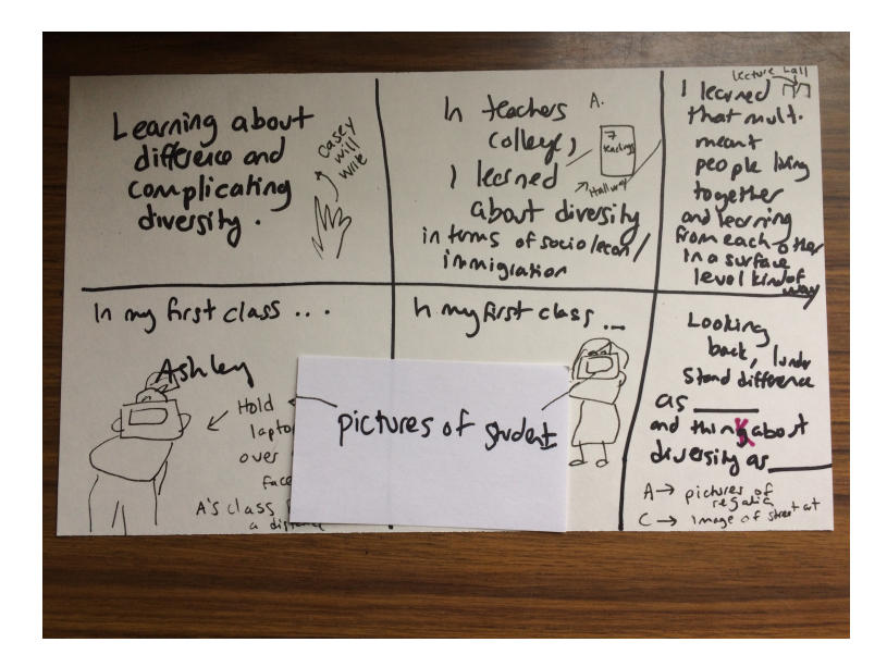
Fig. 1: Cellphilm storyboard

One afternoon, we decided to get together to investigate our memories through the production of a short cellphilm. We began by brainstorming about the words "difference" and "diversity" and we came up with a title for our cellphilm, "Learning About Difference and Complicating Diversity": <u>https://youtu.be/iyuekdE6CCw</u>. When we began planning the cellphilm, we thought that a short two-minute time limit would be useful for the film. After brainstorming the terms, we decided to create a six-shot cellphilm. We wanted to use similar phrasing to tie our two stories together.