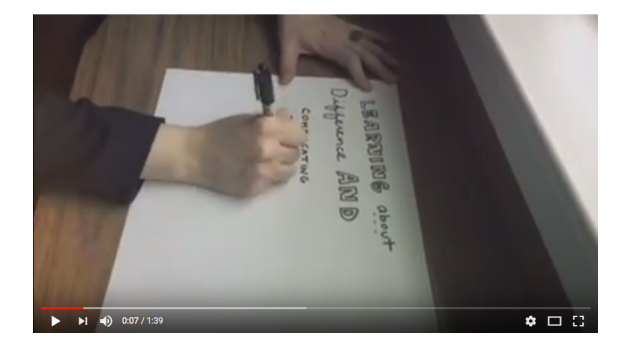
Fig. 4: Opening shot of the cellphilm

The cellphilm opens on an image of a person writing, "Learning about Difference and Complicating Diversity." The camera begins further away and moves closer over a period of a few moments.