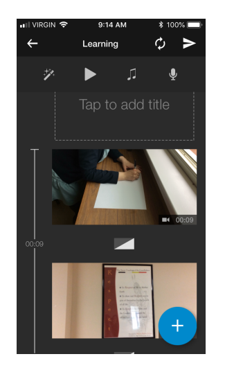
Fig. 3: Editing the cellphilm with an in-phone application

First, Ashley filmed Casey as she wrote the title of the film in the time-lapse function of the cellphone. Then, together, we filmed elements of the university where Casey works and Ashley studies, including a lecture hall, a hallway that features the Seven Sacred Teachings, each of us holding a laptop computer in front of our faces, where we have each displayed an image from our first classrooms. The image is filmed from a distance so that the students could not be identified. Once we had assembled all of the imagery, we came back to Casey's office and began to edit the cellphilm from an application housed on Casey's phone. We sped up some images and slowed down others. We added a filter effect to make the lighting and images appear to have the same feeling. We recorded a voice-over in one take.