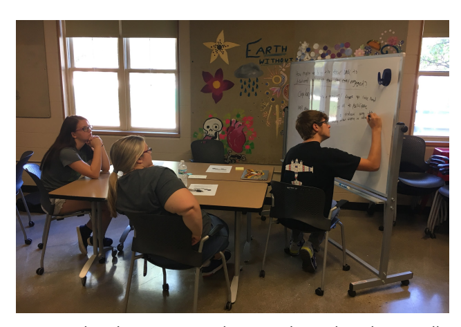
Fig. 4: Students brainstorming solutions and recording ideas visually in the third step of the design-debrief process.

Groups were given a whiteboard to visually record all ideas. This enabled all group members to stay focused on the task at hand and consider all options as they worked to find solutions to their chosen issue (see Figure 3). The students furiously took note of all ideas—realistic or idealistic—deferring judgment and censoring for later. In this stage, they were searching for a spark, an inspiration that might offer a solution to the problem they'd identified.