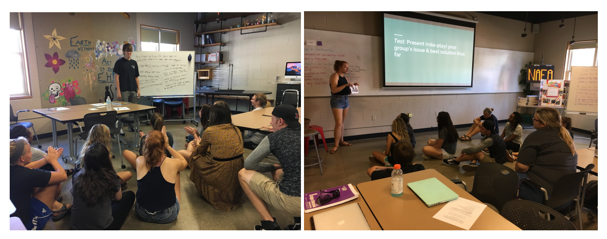
Fig. 7 and Fig. 8: Students testing chosen solutions for entire class for the fifth step in the design-debrief process.

The five steps in the design-debrief process were meant to circulate and not follow a linear pattern that ended after step five. The strength of the process was in the continual reworking and reconsideration of ideas to make them stronger. These preservice students returned two more times throughout the semester to teach the first-graders at the elementary school and had the opportunity to debrief after each session. While debriefing didn't always follow the design-thinking steps explicitly, the students had initially engaged in a reflective process that honored everyone's voices and stories, gave opportunity for contextual expertise, allowed for failure, and encouraged multiple solutions. This experience also invited the teaching teams to trust one another and become closer as they navigated their personal and professional perspectives on their teaching experience.