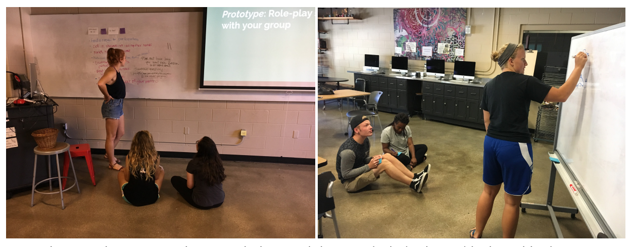
Fig. 5 and Fig. 6: Students prototyping brainstormed solutions with their group for the fourth step of the design-debrief process.

The students tried on different ideas. They were entering in and out of different versions of their teaching story, looking to hone their skills and more quickly adapt to difficult situations. With each prototype, the group would assess and reassess working to identify the characteristics of each proposed solution and what would best fit their teaching context.