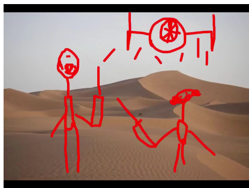
Fig. 4: Scene from Star Wars

Children who were more technically skilled could use a combination of tools to create a slideshow like the one below. For this slideshow, the child chose the desert background, drew a scene from the movie Star Wars , and then audio-recorded himself humming a song from the movie. As in the previous examples, this quite sophisticated digital slideshow did not require advanced traditional academic skills in order to communicate a strong message, but the child clearly displays sophisticated digital skills.