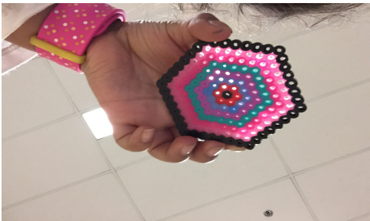
Fig. 2: Photo taken with iPad

The open-ended apps used in this study, 30 Hands and Explain Everything , can be used to create very simple drawings or photos or more complex multimodal creations. Children were able to use the apps at their individual ability levels and could progress at their own pace. Children in the study who faced learning challenges were able to communicate their ideas in ways that helped them to overcome the barriers they faced with traditional paper-and-pencil tasks. For example, children could take a simple photo of the room, themselves, a classmate, or a creation they had made. The photo below was taken with an iPad by the artist, a four-year-old student. She was able to independently and effectively document her artistic creation as a digital slide without recourse to speaking, reading, or writing.