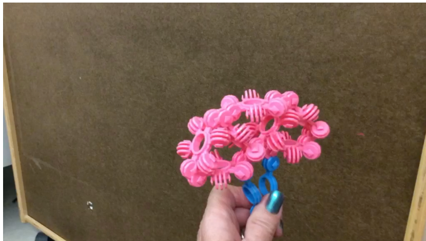
Fig. 1: Aisha's flower

In addition to providing opportunities to practice and enhance their English skills, several educators reported that ELLs used the iPad apps to consolidate their use of their home languages. Children created slideshows in their home language, either on their own or with peers who spoke the same language. This allowed them to enhance their home language and strengthen a home-school connection, which is vital for multilingual children. Aisha, for example, created a flower with classroom materials, asked a research team member to hold it while she photographed it with the iPad, then recorded herself singing in her language. She called it her language song: