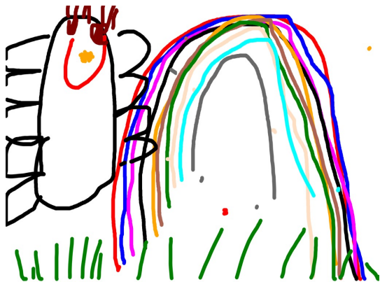
Fig. 3: Rainbow with smiling insect

Children could also choose a blank slide and use the drawing tools to experiment with lines and colours, or they could draw a scene such as the one below. This child has drawn a scene with a rainbow over a field of grass with an oversized, smiling insect. It certainly communicates a story with emotion and energy, but without the use of audio or text.