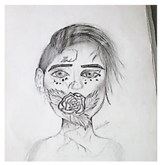
Fig. 4: Couldn't speak. (Photograph of student Visual Art Diary. Photograph by Shirley Clifton, February 20, 2019)

And I always felt like I couldn't say anything, because I thought it was normal. I thought, like, the fighting was normal, the screaming and yelling every night was normal. And then when I came to school, it was all different. I'm, like, well, it seems like I am the only one that suffers this? So, I always felt like my mouth was overgrown with stuff that I couldn't say. That's why there's a rose growing out of her mouth. (Student interview, October 9, 2020)