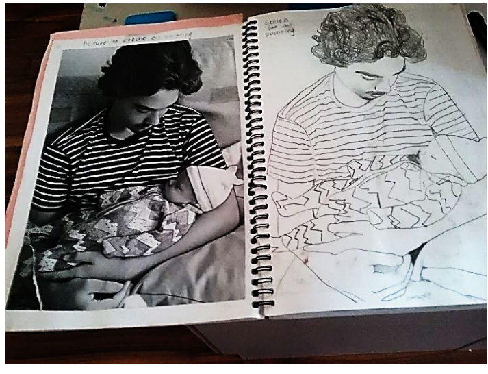
Fig. 8: Caring for family. (Photograph of student Visual Art Diary. Photograph by Shirley Clifton, November 1, 2017)

The photograph selected for the portrait was carefully chosen to show a deep sense of caring. It privileges the importance of family relationships and reflects the student's cultural values.