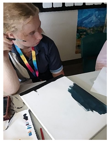
Fig. 3: Reflecting inner feelings in artmaking. (Photograph of students in the VA classroom. Photograph manipulated for the purposes of participant deidentification. Photograph by Shirley Clifton, February 20, 2019)

Shaniya expanded on this reflection referring to another image from their VAD. The image chosen was the head and shoulders of a female figure with a rose in place of the mouth and thorns twisting down around the neck of the figure (Figure 4).