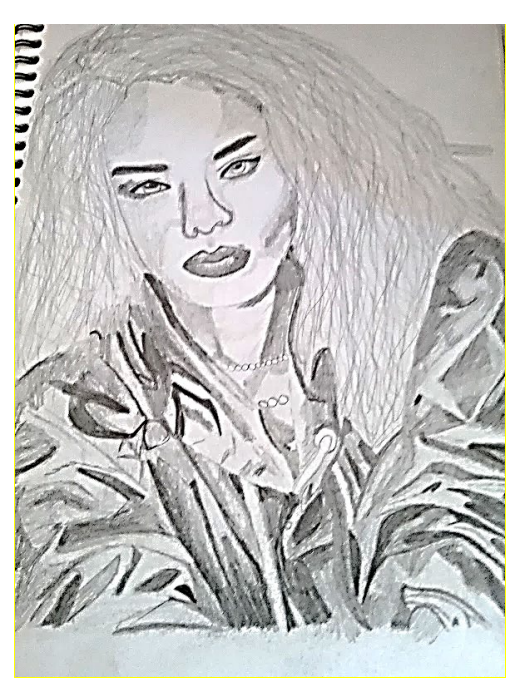
Fig. 6: Intersection of memory and medium. (Photograph of student Visual Art Diary. Photograph by Shirley Clifton, November 1, 2017)

Researcher: So what made you proud of it?