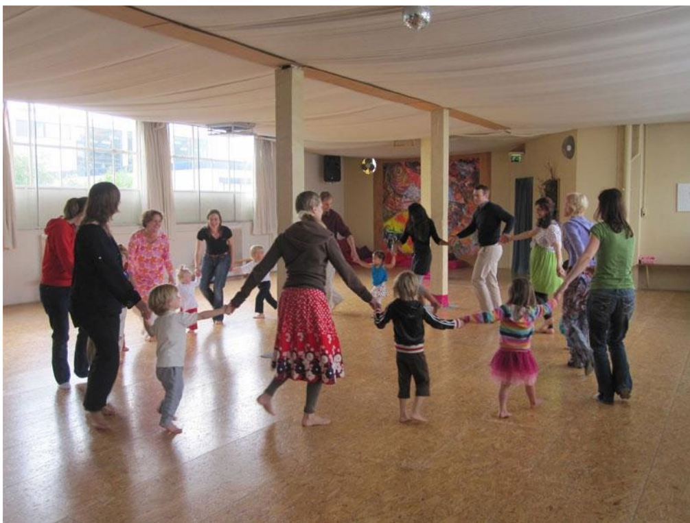
Fig. 1: Biodanza #1.

Biodanza is a facilitator-led practice that follows a series of dance, play, and/or interactive exercises, designed to activate the sympathetic nervous system, followed by the activation of the parasympathetic nervous system, which restores physiological balance as it improves mood and releases anxiety