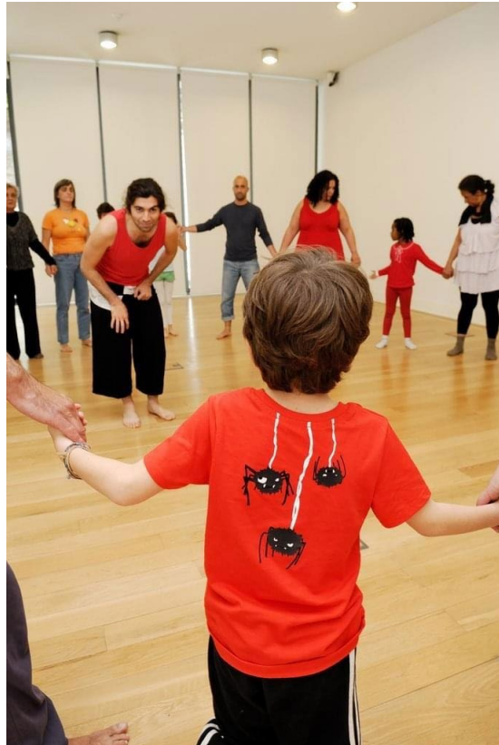
Fig. 3: Biodanza #1 (Photo used with permission from Cristiano Martins, Facilitator/Didact Biodanza School SRT of Porto and Portugal, 2019).

While people who engage in dancing activities might do so simply because they all find it enjoyable, dance also serves as a pedagogical tool. Dance has been used with efficacy “as a kinesthetic tool for accelerating learning whilst assisting educators to recognize movement methods as potent delivery strategies” (Golding et al., 2016, p. 239). Furthermore, according to Sharma et al. (2020), “dance-based teaching can potentially ignite cognitive learning in children, since physical movement deepens neural connections” (p. 30). Thus, more educators are becoming increasingly aware of using dance in a cross-curricular fashion, not just teach dance as a subject on its own.