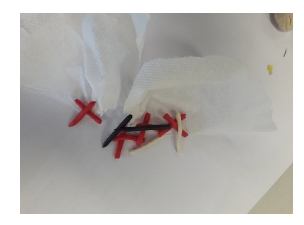
Fig. 1: Material and stuff