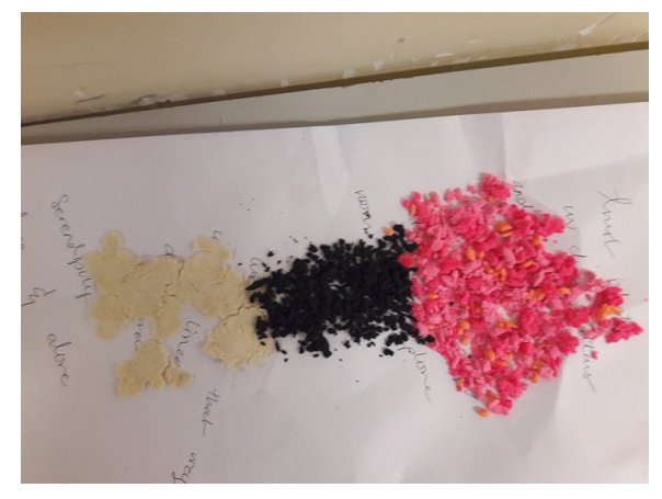
Fig. 3: Flakes of plasticine

Two students work together with coloured plasticine, and we find the plasticine has reached a ripe old age. It flakes in their hands, becoming the shards of a comet in a tactile, miniature, primary-colour, page-framed galaxy (see Figure 3). Colours of plasticine demand collaboration from artists who are led by its delicate textures to better understand the thinking of material in their different research projects. This sense-making collaboration between plasticine, artist-researchers, and words (Figure 4) leads us to consider things differently—the notion of parts and wholes, of the different qualities that make up a body of knowledge, the sense of following the texture of an idea and letting one's experience of sensory pleasure lead the research, as new possibilities of composition/thinking arise in relational, conversational, and multi-modal spaces. As demonstrated in Figures 1, 2, 3, and 4, the page became an entanglement of thought, words, shapes, lines, and plasticine. A performance of writing through "an entangled creation of knowledge that "breaks through" pre-established notions of non/human agencies in order to produce encounters in which political and material intra-act to be "part of that nature that we seek to understand" (Barad, 2007, p. 26; Revelles Benavente & Cielemecka, 2016).