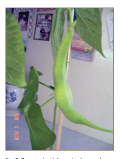
Fig. 3: One student's "amazing" green bean

At the end of the study, one student slipped two photographs under Hughes-McDonnell's office door. One photograph showed a leafy bean plant. The second photograph focused on a single green bean.