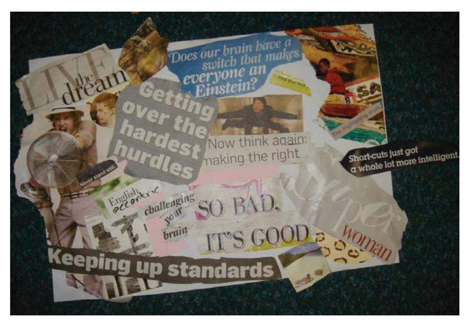
Fig. 3: Collage-making

These resources included image-based activities to stimulate discussion, and collections of images for storytelling and theme-based reading and writing tasks. Responses to these activities suggested their usefulness for practice: illustrative examples of positive responses were that they: "Provided great ideas" and "It really helped me in my teaching practice."