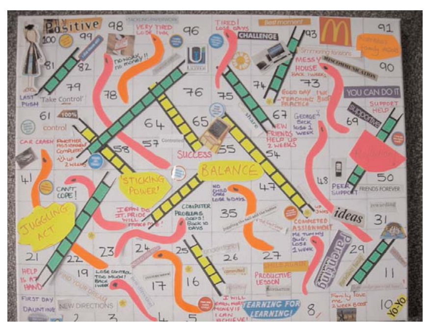
Fig. 5: Snakes and ladders game

The table illustrates the frequency of use of each of the methods. The higher frequency of use by the second year students is borne out by their comments on the evaluation forms, which indicated a higher level of willingness than among the first-year students to engage and to try these methods out in their practice. Given their additional experience, this is not unexpected, nor is the relatively extensive use of preexisting images as a focus for reflection. This suggests that the threshold activities were a supportive way of engaging students with arts-based methods.