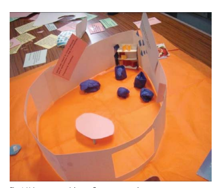
Fig. 4: Using art materials to reflect on course themes

This comment indicates the potential for the development of self-awareness and confidence for literacy learners through the process of collage-making; it also demonstrates the significant role which the tutor plays in facilitating such a process. As a multidimensional form of meaning-making that juxtaposes image and text, collage provides opportunities to identify new understandings of the relationships between word meanings and visual symbols and how the individual learner relates to these; it thus provides a process for crossing thresholds into expanding conceptual spaces.