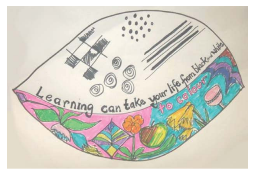
Fig. 1: Using arts-based approaches: results and reflections

methods. It builds on Poincaré's notion of creativity as a series of phases of preparation, incubation, illumination and verification (Balzac, 2006). Creative reflection comprises the stages of preparation, play, exploration and synthesis, and includes individual and group activities such as creative thinking exercises, playing games, drama, creative writing, and art-making. The preparation stage acknowledges the uncertainties of the creative process and provides "threshold activities" (Tracey, 2007) to support engagement. These activities do not require participants to generate creative artifacts, but to respond to existing images. The second stage, play, offers opportunities to explore ideas in an unthreatening environment. Typical activities include creative thinking exercises and the creation of acrostic poems and collage-making. The third stage requires a more deliberative exploration of ideas, whereby individuals and groups design and produce artifacts such as films, poems, artwork, pieces of music and dramas. The final stage, synthesis, involves individual and group reflection on the processes of learning and meaning-making and on applications to students' practice.