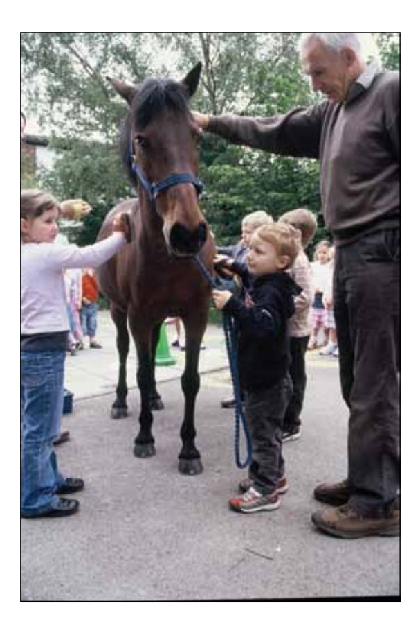
Fig. 3: Transport museum — horsepower

A focus on transport can be so extensive that it can become hard to manage. We prefer to examine one or two aspects of transport in depth. On one occasion we based our work on horsepower: this was not a static display but rather an example of learning in action. Horsepower was formerly an imperial unit of power equal to about 750 watts and was for many years in common use as a measurement of engine power. We decided to approach the idea of transport through the daily visits of the postman because the children had some active knowledge of the work of the postman on his rounds at home and at school. We arranged for all the classes of children to meet the postman in his van at the front of the school and to collect the school post. He gave them an overview of his work, bringing a delivery bicycle on two mornings and a post office van on two other days. He also explained that the delivery of letters was originally financed by the receiver of a letter prior to the introduction of the Penny Post in 1837 and that postal deliveries were made on horseback or mail coach.