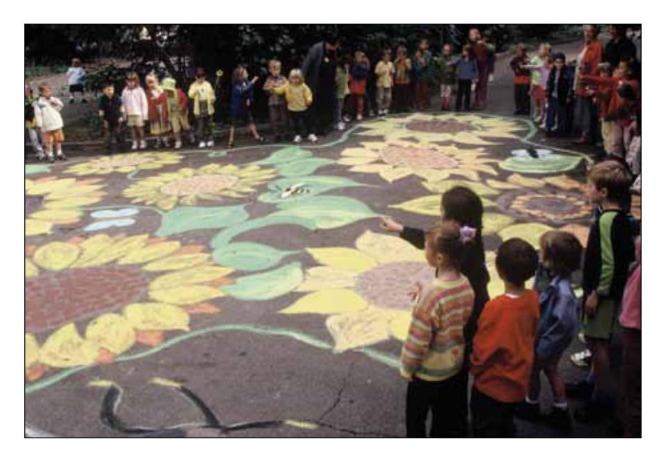
Fig. 4: Sunflower art

The exhibition of pictures synchronizes with the blooming of the sunflowers in September. Art gallery reproductions by Monet, Vincent van Gogh, David Hockney, Van Dyck, Georgia O'Keefe, Isaac Fanous, and others are the inspirations.