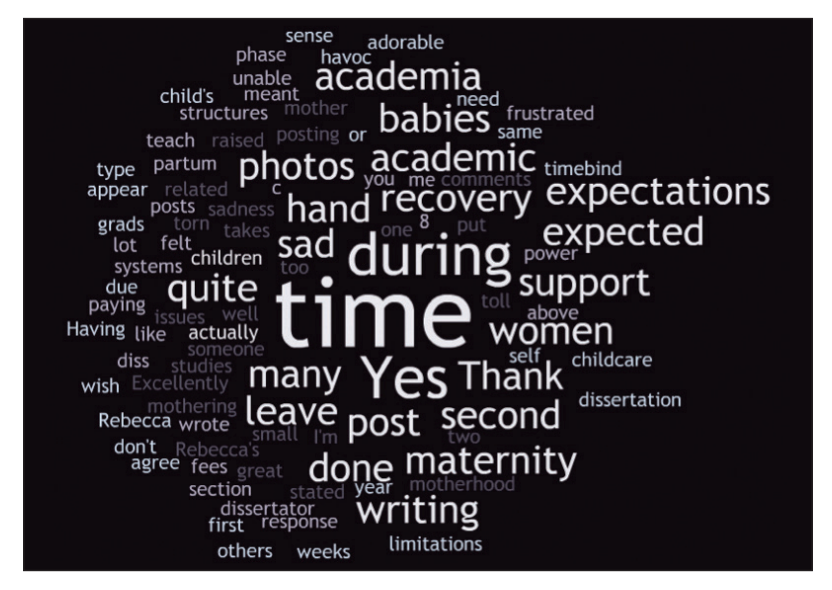
Fig. 4: Word cloud using a set of eight comments discussing a conflict of feeling

In order to get a fuller picture of the overall feeling of the totality of comments and understandings of the academic mothers' posts on #amworkingwithbaby, I created three additional word clouds. The first additional word cloud included a set of eight comments discussing a conflict of feelings and concern about the "social pressure of being a supermom" (see Figure 4). The most common words were: time, during, and yes. Additional common words used included: academia, babies, academic, photos, expectations, expected, recovery, hand, sad, quite, support, women, many, leave, post, thank, second, done, maternity, and writing.