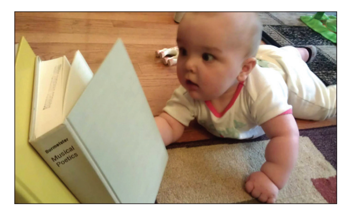
Fig. 2: Baby crawling towards and touching academic books

When the captions were added together into one cohesive unit, I found they presented a narrative of the (im)balance of being a mother writing academic works while raising and caring for a young child. While the words provide many insights into the experiences of those posting #amwritingwithbaby, as mentioned previously, the words did not provide the whole picture. For instance, one academic mother's comment, "I was even fortunate enough to have a research assistant," appears to present a positive feeling of having support, yet the image that accompanied the quote shows a different aspect. The image (see Figure 2) showed a young baby crawling towards a set of academic books. As the image focuses on the baby, without situating the academic mother in the picture, it appears the baby is the only one with access to the books (as toys?) and thus suggests the difficulty of completing academic work.