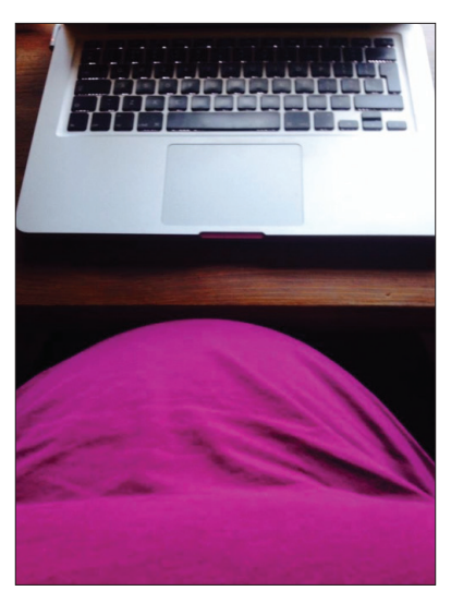
Fig. 1: An academic mother's vantage of having to reach across her pregnant belly to reach her computer

the meaning of the words. In examining the image, a photograph showing a protruding, apparently pregnant woman's stomach extending towards a desk, it becomes clear the academic mother is referring to the utility of her arms ("good thing my arms are long") to get beyond her pregnant belly to reach the laptop computer.