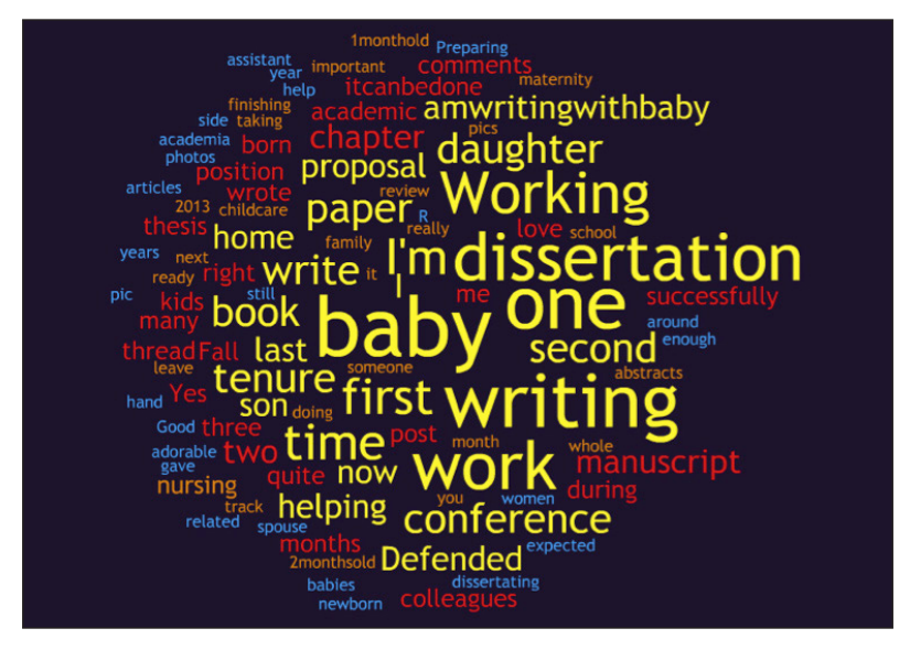
Fig. 6: Word cloud using all comments from the Facebook post, #amworkingwithbaby

Lastly, the final word cloud included all comments from the post #amworkingwithbaby (see Figure 6). The most common words are: baby, one, writing, dissertation, and working. Additional common words used included: amwritingwithbaby, daughter, proposal, paper, home, write, I'm, book, last, tenure, son, first, second, time, now, helping, conference, and defended.